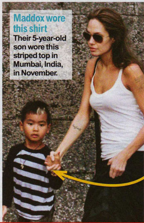
Maddox wore this shirt Their 5-year-old son wore this striped top in Mumbai, India, in November.