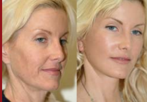
45 year old patients s-p short scar face lift