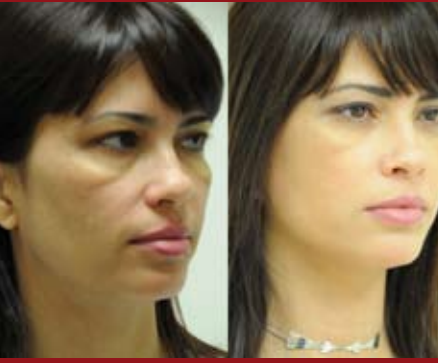
44 year old patient s-p one stitch face lift